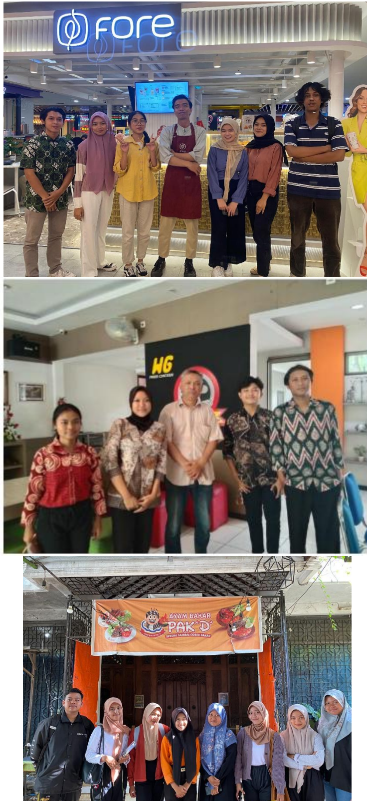
Figure 3. Student activities conducting group observations