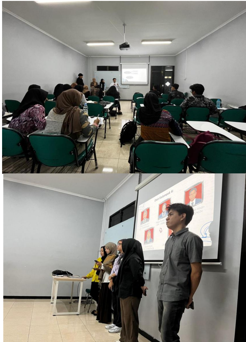
Figure 1. Student activities when presenting observation results