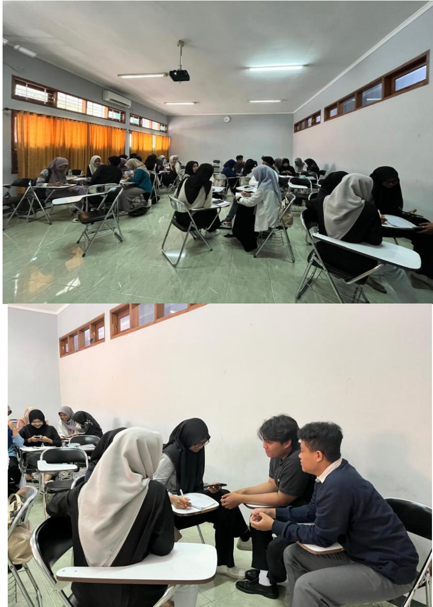
Figure 2. Student activities in group discussions