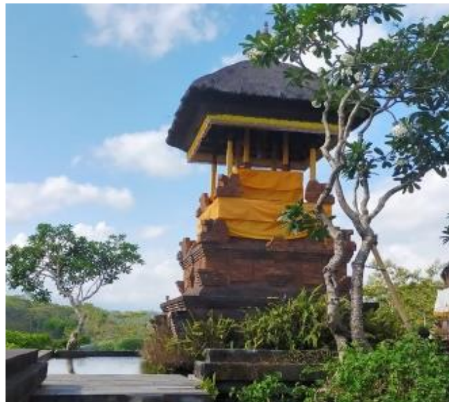
Figure 3: Bale Kulkul at Mandapa Ritz-Carlton, Ubud

Furthermore, the willingness for social culture and the community can be seen from attending the temple festival ceremony, mepeed (parade), making gebogan (offering), adopting Balinese style ornament (Figure 3), and welcome drink accessories.