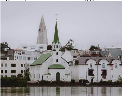
Figure 2: Architecture in Iceland

In interior furnishing design, in order to better adapt to the difference in climate, houses in cold areas and houses in hot areas will inevitably appear in different forms. In cold region such as Northern Europe, residential buildings like to use fur, wool knitted fabric, wood and other materials, install fireplaces, use double-layer windows with smaller size, and thick and closed walls (Figure 2-3). While in the Mediterranean area, where the climate is relatively hot, the houses are lighter and more open. Low-walled corridors (Figure 4) are often used in the architecture. In addition, they also like to use ceramic tiles and stone, weaving bamboo, gauzy fabric (Figure 5) and floor-to-ceiling glass windows.