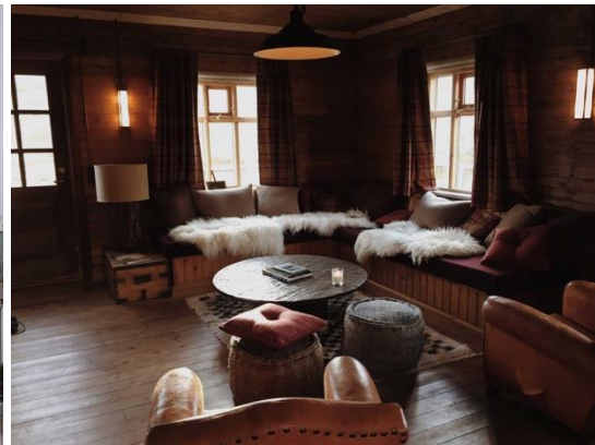
Figure 3: Iceland Deplar Farm Hotel room