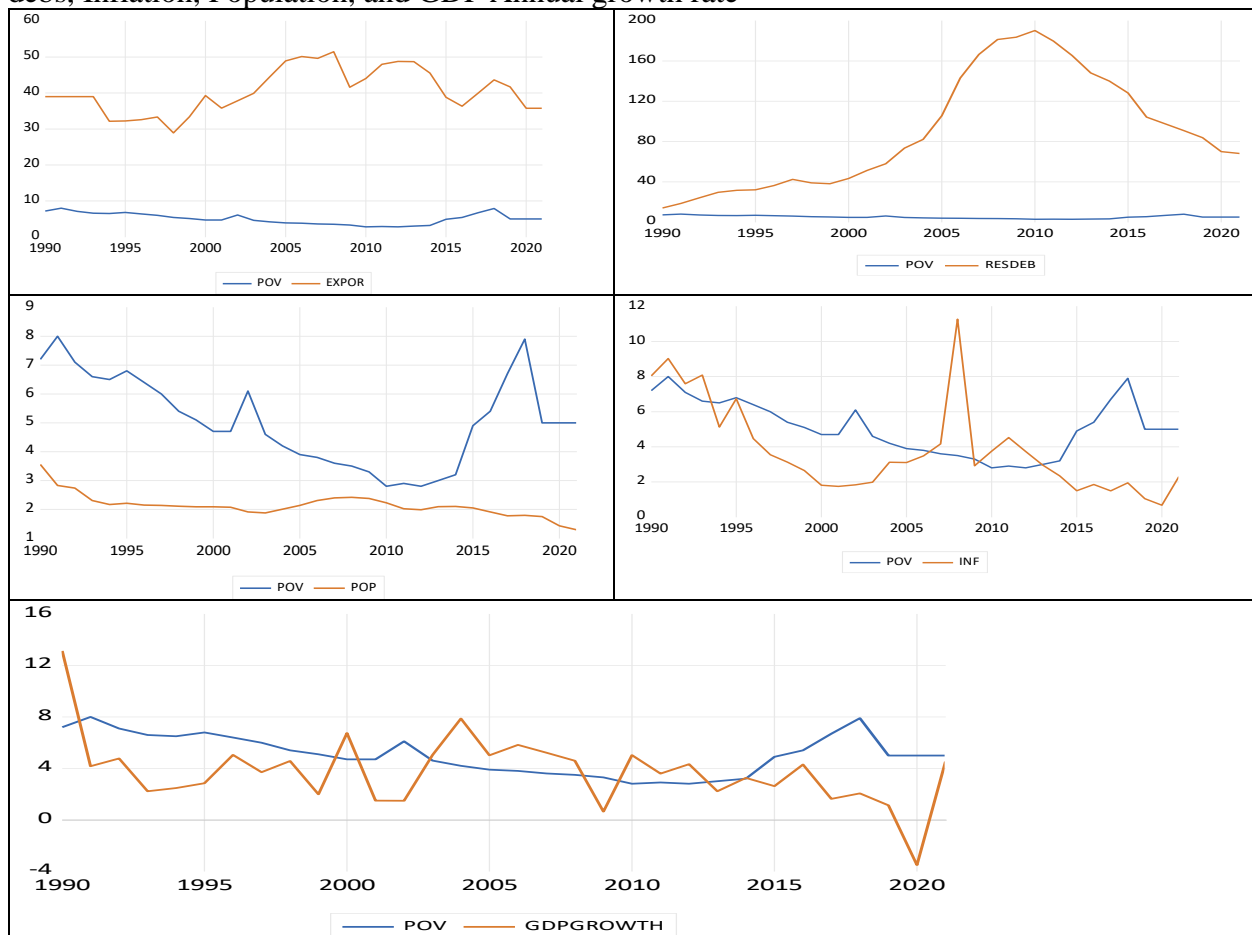
Chart No(1) The correlation between poverty gap and: Exports, Reserves to External debts, Inflation, Population, and GDP Annual growth rate