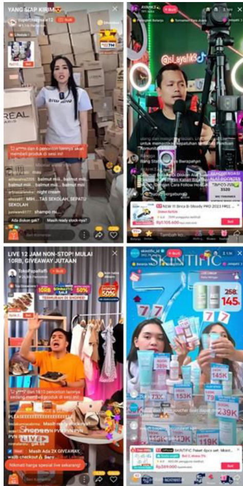
Figure 3 Product Display in Live Shopping

The use of visual composition, such as product placement, negative space, and the layout of supporting accessories, can influence the audience's focus and create an appealing aesthetic impression. The selection of background images, lighting, and props settings also contribute to the viewer's experience of perceiving and judging the product. Figure (3) shows some screenshots showing the product layout in live shopping. Other product-related elements, such as discounts, flash sales, giveaways, purchasing vouchers, etc., are also displayed.